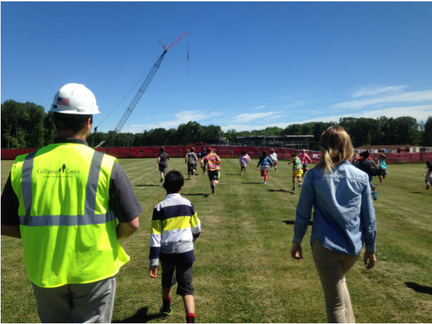
Orchard Hill Grade 4 class visits concluded with a fun-filled field afternoon of hands-on learning!