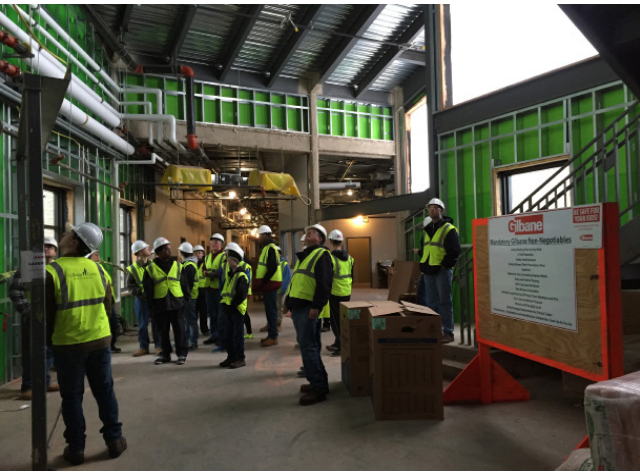
Students tour Orchard Hill under construction during an ACE Mentor site tour led by Gilbane