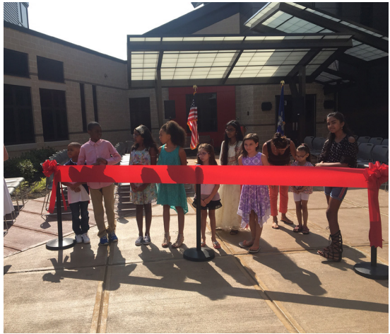
Gilbane joined the South Windsor community to celebrate the ribbon-cutting ceremony for the new Orchard Hill Elementary School