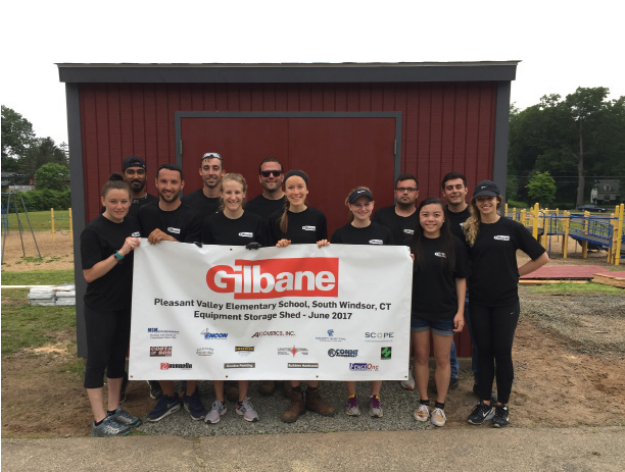
Gilbane Young Professionals built a new recess storage shed for Pleasant Valley Elementary School